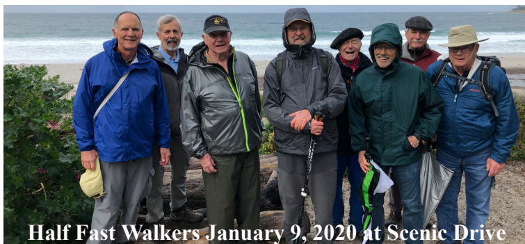
Half Fast Walkers January 9, 2020 at Scenic Drive