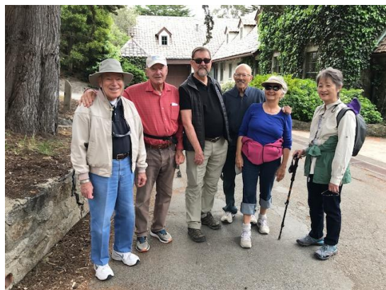
Walkers at the Flanders Mansion