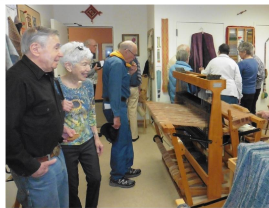
Open House at the Weaving Room