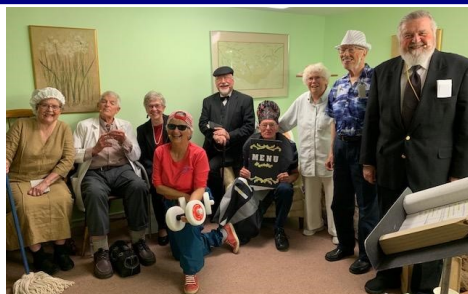
Carmel Valley Manor Players

Las Marias Restaurant - an excellent Mexican Restaurant in Seaside - has been open 6 months. We will have a taco bar with pork, beef, or fish and all the fixins, including beans and rice, plus cheese quesadillas--all for $15, which will include beverage, tip, and tax. Laura will treat everyone to a margarita (and they make good ones). Manor bus leaves at 4:30.