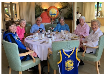
We worship the Warriors