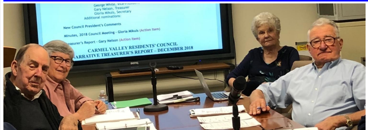
New Residents' Council Officers