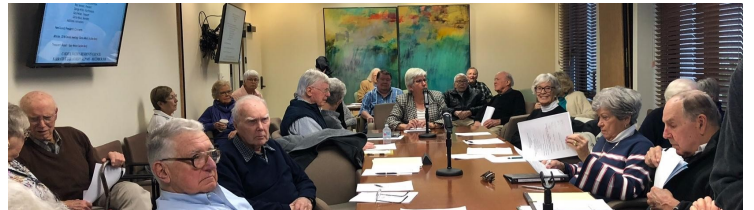
Our Residents' Council at Work