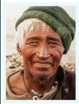
photo or dressed for the role. Many she caught at celebrations. This is part of the fun of identity. Your selection of the direct gaze may not be the same as mine. I found eye contact in the eyes of the Tribal Chief in India. The description said he had a tough job in rugged mountains. Yet he appeared happy. Then I

All of the people pictured appear to be prepared for the